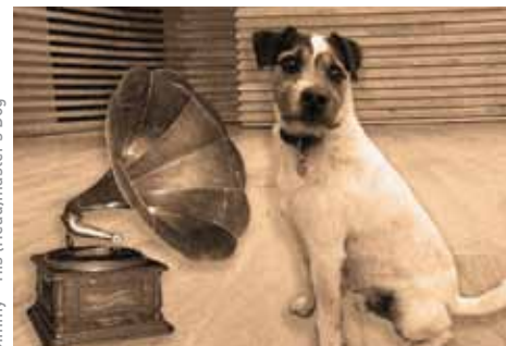
Jimmy - His (Head)master's Dog